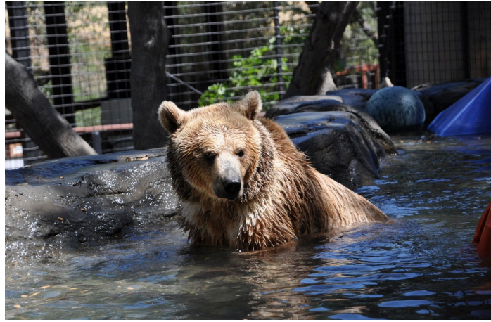
Bathing beauty, Matilda